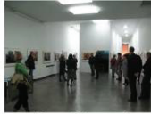
Participants of the symposium visiting the exhibition