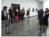
Participants of the symposium visiting the exhibition