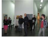
Participants of the symposium visiting the exhibition