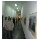
The audience at the opening