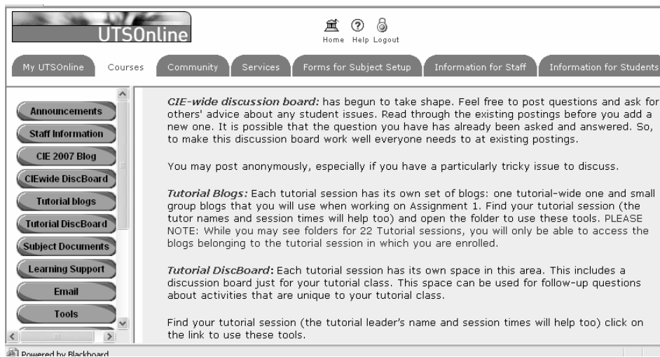
Figure 1 shows the three levels of blogging zones created within the online course site – class-wide, tutorial wide (e.g.: each of the 22 tutorials had a zone) and group wise (e.g.: each tutorial class had four or five small groups who worked weekly in their group blog).

As a foundation course for the undergraduate program, it is essential that students not only study communication and information environments, but that they learn to develop critical capacities involving discussion forums, blogs and collaborative online tools. Thus, as part of my redesign of the subject, I decided to make fuller use of collaborative online tools like small group blogs within our syllabus this past year. Doing so involved shaping class activities, work between classes as well as a major assignment around the use of these blogs.